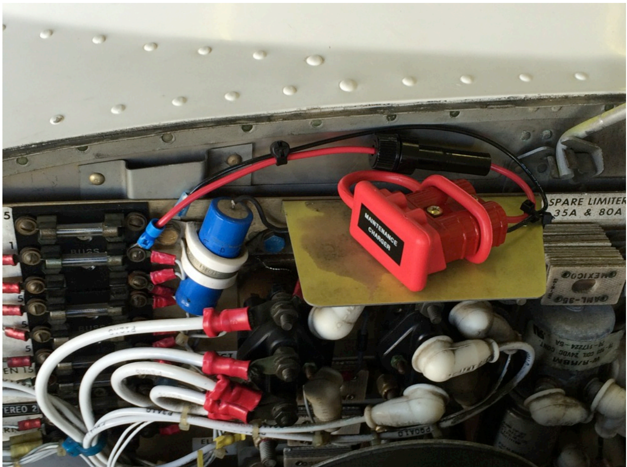
Charger plug, fuse holder, and leads attached to the fuse block and airframe ground. Ready to use.